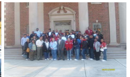
Mt. Vernon Ave. AME Church Annual College Tour on campus at JCSU.